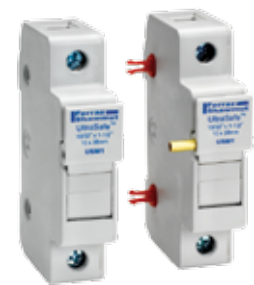
USM1 with USPTH Pin-Ties